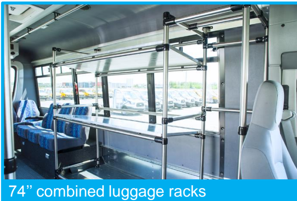
74" combined luggage racks