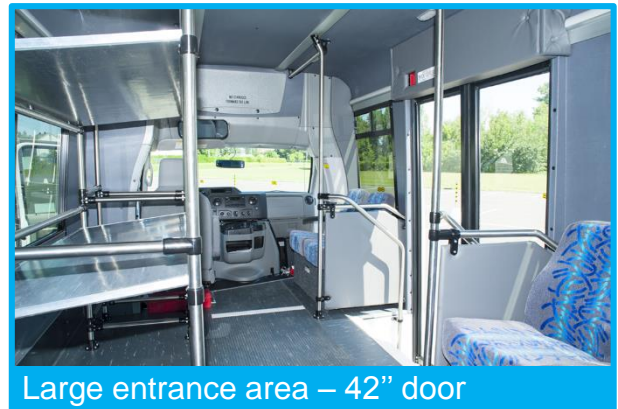
Large entrance area – 42" door