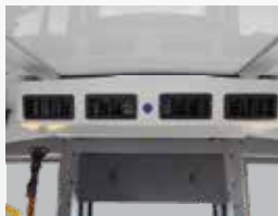
Multiple AC Configurations, Up to 100,000 BTU