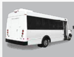
Dark tint panoramic windows