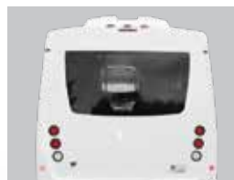
Extra wide rear view window