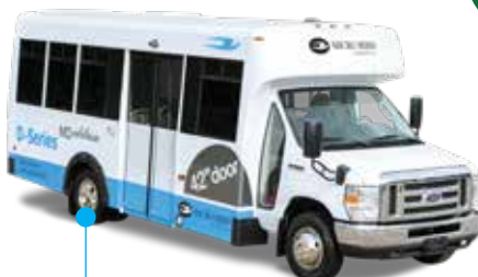
D-Series MD EDITION