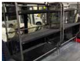
New luggage rack