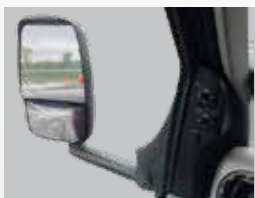
New Velvac Mirrors